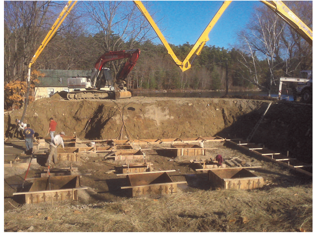
Photo: The new Maine Lakes Resource Center begins. Our new landmark in the Village, the Maine Lakes Resource Center, is planned for opening the middle of next summer.