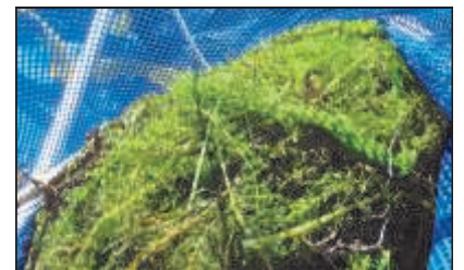
Photo: (above) Variable leaf Water Milfoil from the Great Meadow Stream infestation removal effort this summer

From Houston, TX -Colby College '13 -Biology: Environmental Science Major -Captain of Varsity Swimming -1 st year with BRCA Interests: weight training, cycling, ecology, travel, student government, barbecuing Favorite Movie: The Godfather Favorite Band: Rolling Stones Career Aspirations: Environmental consulting